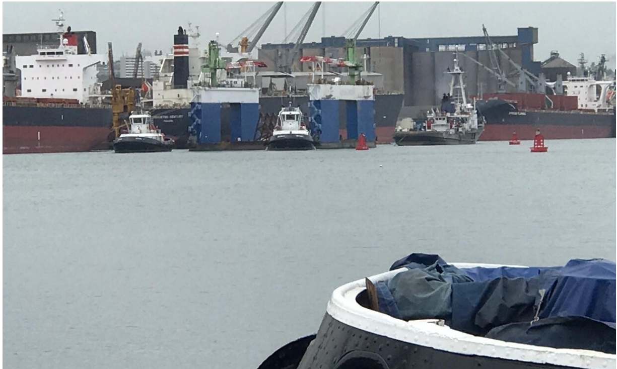
A floating dock owned by Southern African Shipyards was transported to East London for to be used in a multi-million rand Transnet National Ports Authority (TNPA) dry dock caisson gate refurbishment project.

"The Southern African Shipyards floating dock will serve as the dock while the repairs are made," he added.