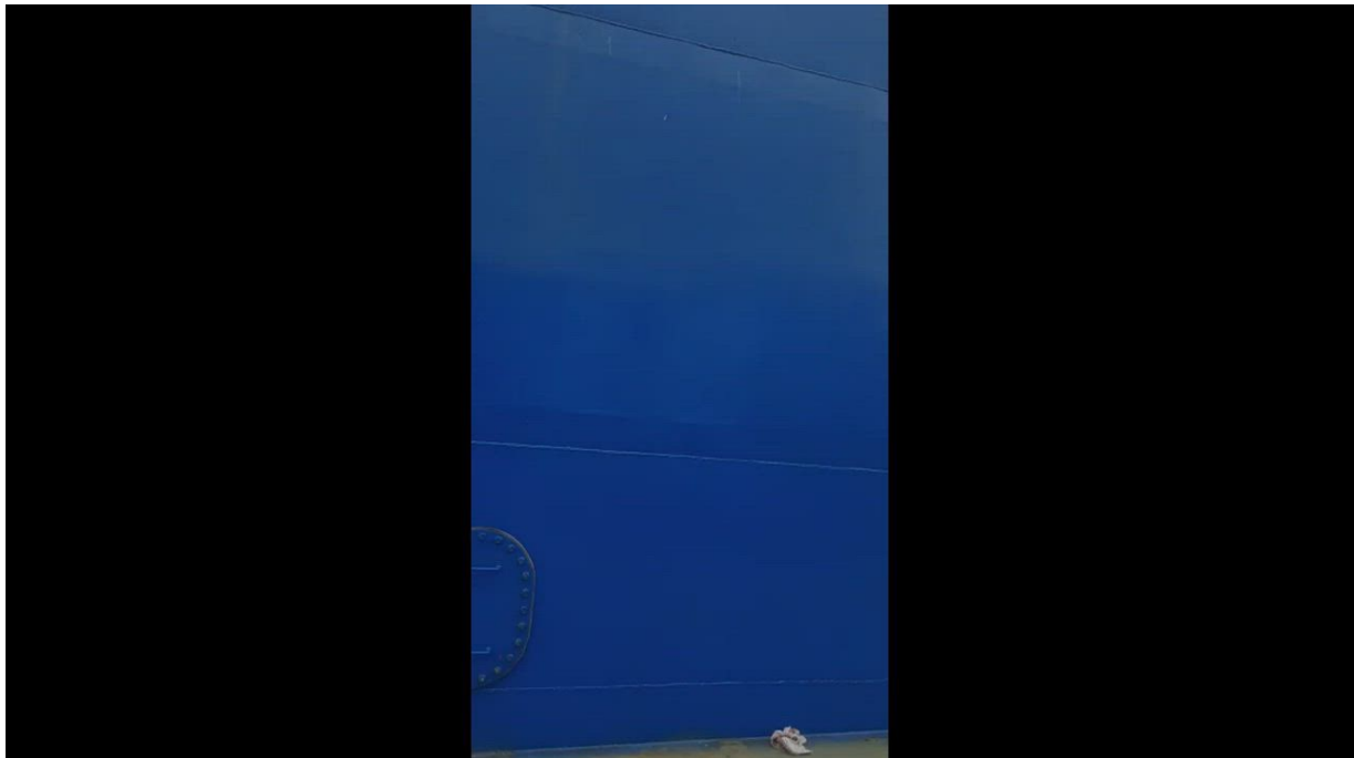
A floating dock owned by Southern African Shipyards was transported to East London for to be used in a multi-million rand Transnet National Ports Authority (TNPA) dry dock caisson gate refurbishment project.